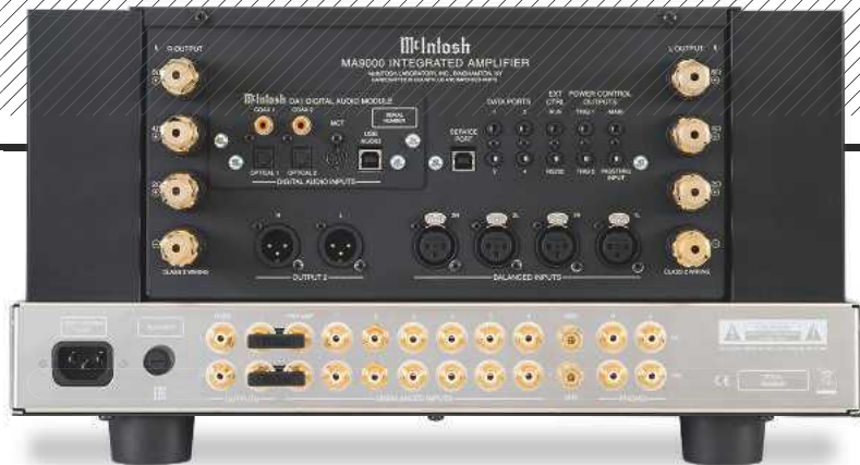
ABOVE: No fewer than eight line ins (six on RCAs, two balanced on XLRs) are joined by MM/MC, plus fixed (RCA) and variable (XLR) pre outs and 8, 4 and 2ohm speaker outputs. There are also four S/PDIF digital ins (two coax/optical) and a USB Type B

for the speakers in use. In set-up we'd selected the 4ohm setting for the B&W speakers, but things livened up remarkably when we switched to the 8ohm output.